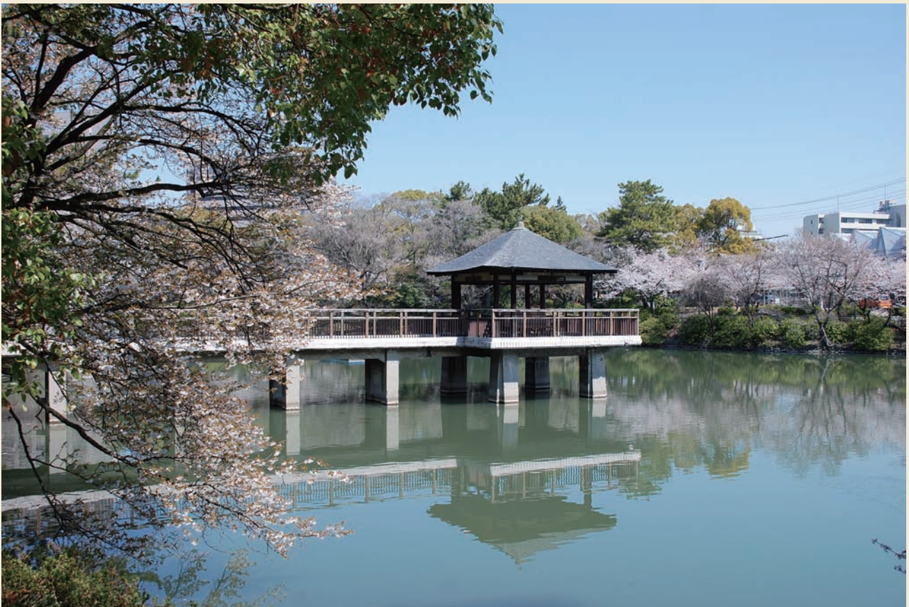
Tsuruma Park, Nagoya, JAPAN